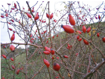
Food for Free Rosehips 2009

A new branch of the artist's ongoing cartographic project Food for Free which invites participants to view the city via the edible plant organisms that dwell within public spaces of Bristol, edible feral, wild and domestic plants can be located identified and harvested via this map that excludes road names in favour of plant names. The artists have selected a section of their map to be rendered as a brass memorial plaque, focusing on Brandon Hill. Visitors are invited to make their own Food for Free brass rubbing to take away and use in the Park where the plaque will be re-located in Spring 2010, a short walk from Arnolfini. In Arnolfini Café Car, The Rosehip Trade invites public contributions of foraged rosehips as ingredients for its menu in exchange for a rosehip drink and recipe leaflet that explores the different histories of this seasonal fruit. The artists will host a tree planting party in Brandon Hill Park (see events). http://duo.irational.org/food_for_free/