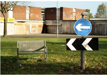
Soft Bench Glebe Farm Council Estate Birmingham 2005

This soft public sculpture produced through a workshop process involves knitting and yarn sourced from a local flock of Jacob sheep. The finished work was presented at KWMC (27 Nov-3 Dec) before its re-location to Arnolfini to function as a platform for sharing knitting skills and dialogue, facilitated by local knitters. A knitting pattern PK2 which documents the process and family packs are available to take away. Salon Bench Knowle West is part of a 'flock' of eight benches produced by self-organised salons around the UK, entitled The Knitting Salon . A Civic Inauguration of The Knitting Salon will take place at The Mall Bristol, in Broadmead shopping Centre and the platform is offered to Arnolfini for discussions during Craftivism (see events).