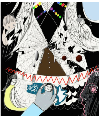
Extended Family 2009