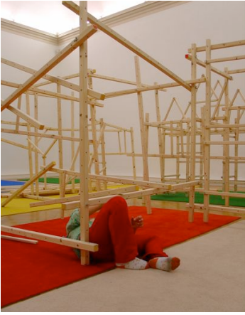
bau-Stelle 2008

YouTube Records JODI (NL) JODI use and abuse the codes of the internet as their artistic material. For Craftivism , JODI take YouTube videos of people singing, etch them onto vinyl records, play them on a turntable and record it, then post the video back to YouTube. The interest is in how YouTube facilitates interaction through action and reaction as well as ongoing user commentaries. The work is installed as a networked computer showing the growing collection of 'hacks' and the gramophone and vinyl disks produced thus far and over the duration of the exhibition. In this way, the contrast of analogue and digital media objects and processes is made explicit. http://folksomy.net