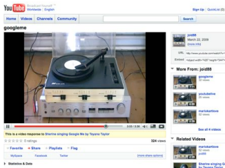
YouTube Records 2009

YouTube Records JODI (NL) JODI use and abuse the codes of the internet as their artistic material. For Craftivism , JODI take YouTube videos of people singing, etch them onto vinyl records, play them on a turntable and record it, then post the video back to YouTube. The interest is in how YouTube facilitates interaction through action and reaction as well as ongoing user commentaries. The work is installed as a networked computer showing the growing collection of 'hacks' and the gramophone and vinyl disks produced thus far and over the duration of the exhibition. In this way, the contrast of analogue and digital media objects and processes is made explicit. http://folksomy.net