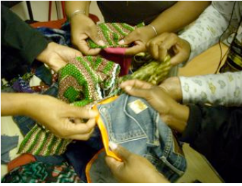
CASSAVA workshop 2009

prints, cloth traditionally associated with Nigerian cultural dress. Visitors are invited to collectively try on and wear the composite costumes around the exhibition. The work was first shown at Full Circle on 2 December and will be worn by its makers in the 2010 St Paul's Carnival.