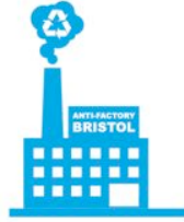
Anti-Factory Bristol 2009