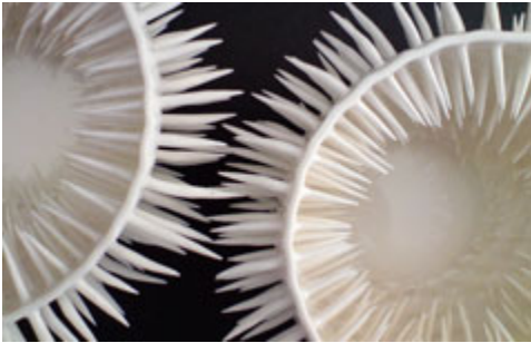
Ikuko Iwamoto, Spikyspiky Bowl, Porcelain, 15cmx15cmx8cm