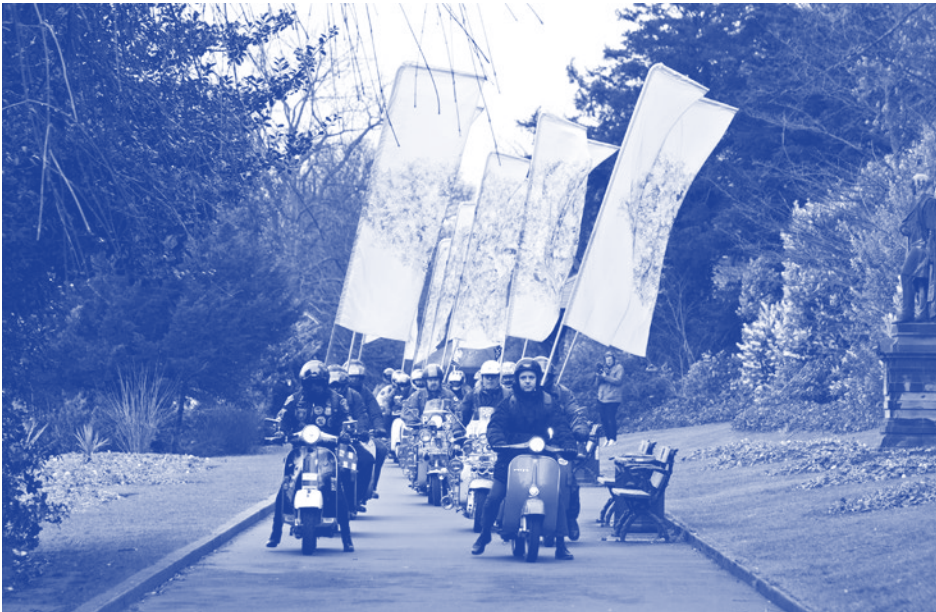
Richard William Wheater, Tree and Scooters , 2013. Acts of Making Festival 2015, Shipley Art Gallery.

Acts of Making is a two-week festival celebrating contemporary craft through performances, live installations and workshops. Events will be held at the Plymouth College of Art, Plymouth City Museum and Art Gallery and Mount Edgumbe House and Country Park, as well as more unusual spaces across town. We want you to contribute, collaborate and capture your discoveries.