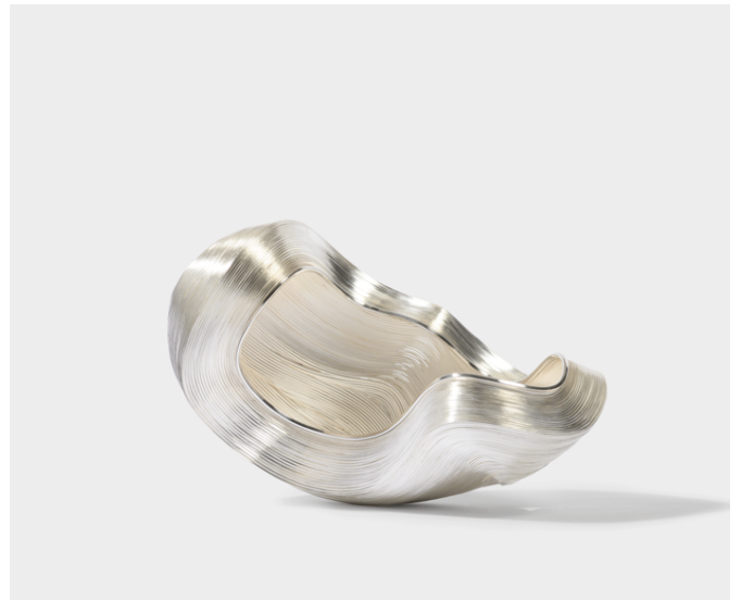
Silver Basket by Nan Nan Liu, represented by Goldsmith's Fair

For 2020, Collect is moving to a striking new home at Somerset House and is excited to be taking over a large number of beautiful rooms, presenting a new environment for Collect exhibitors to contextualise and curate modern craft. Collect will occupy the large gallery wings at Somerset House, overlooking the Edmond J. Safra Fountain Court.