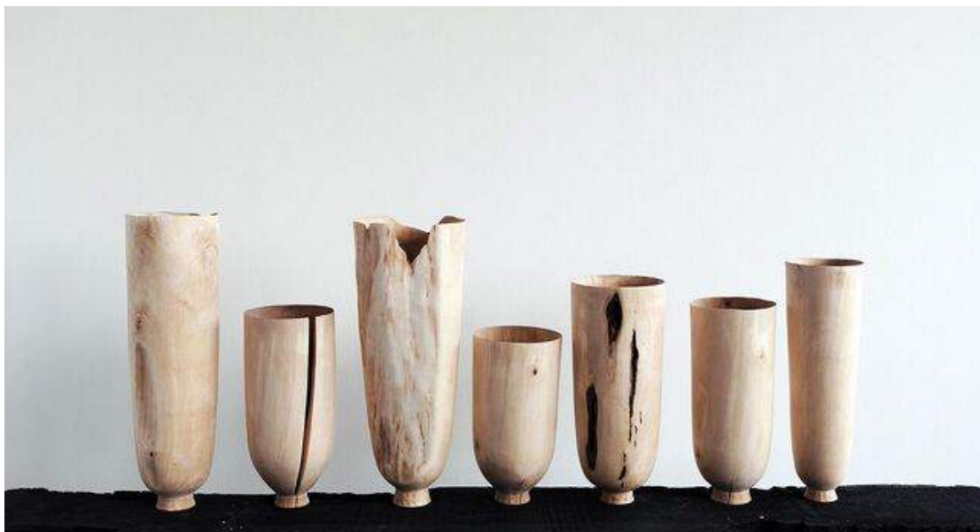
Birch Standing Vessels by Forest + Found.

A year in a life told in a tapestry, the aftermath of a meal presented as a 20-piece metal still life, an enclosed garden of sculptural jewellery, a plea for ocean preservation made by hundreds of smoke-fired ceramic fish... The installations of Collect Open 2018 provide a striking and sometimes provocative insight into the power of craft to tell stories, make arguments, and explore ideas big and small.