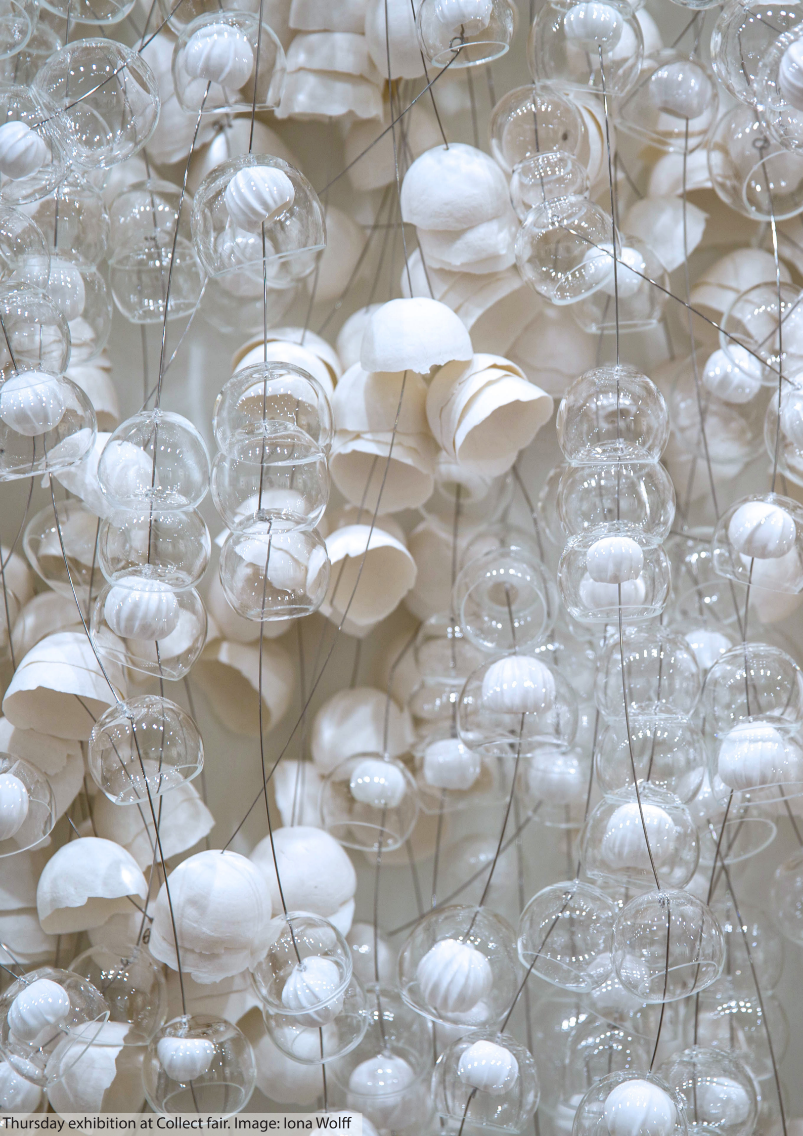
Thursday exhibition at Collect fair.