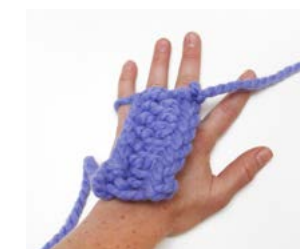
Easy-Read Finger Knitting