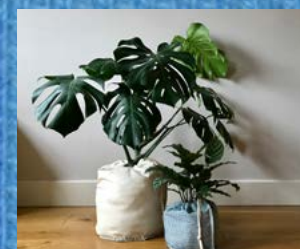
PLANT POT COVER