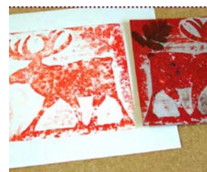
Easy-Read Printing Using Found Materials