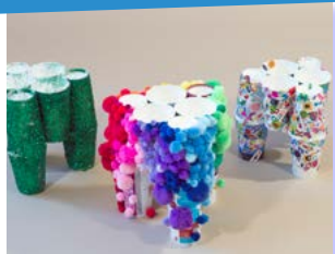
Easy-Read Bubblegum Cup Stool