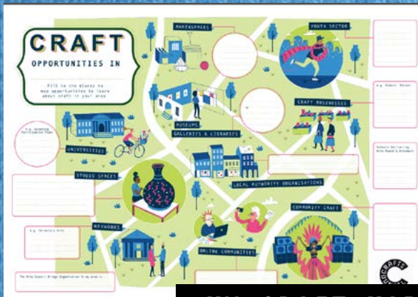
MY CRAFT MAP