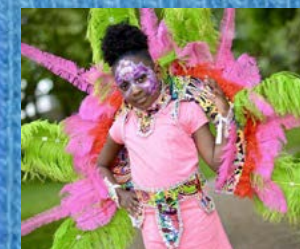
MAS BAND COSTUME