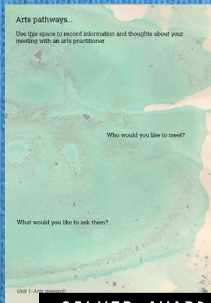
SILVER AWARD LOG BOOK