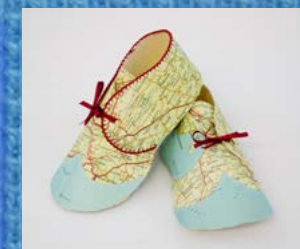
PAPER CRAFT SHOES