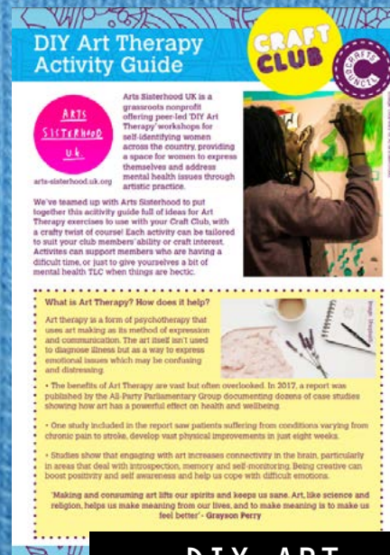
DIY ART THERAPY GUIDE