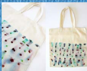
CHROMATOGRAPHY TOTE BAG