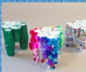
BUBBLEGUM CUP STOOL