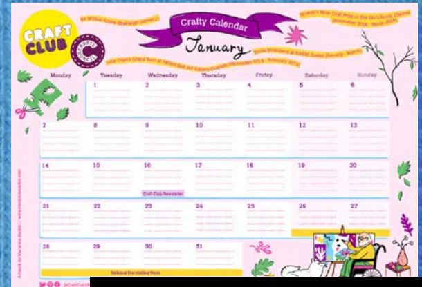
CRAFTY PLANNER 2019