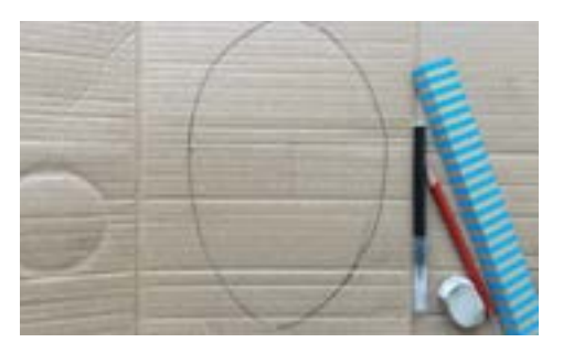
Using a ruler and a pencil measure and draw out the pieces you need.