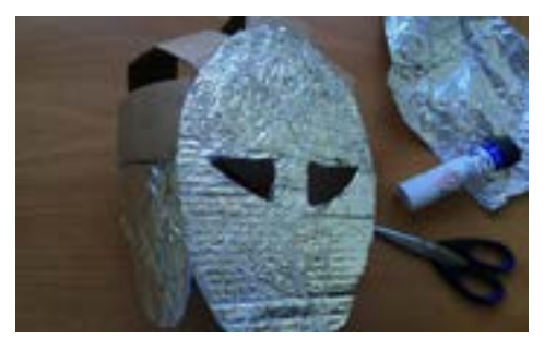
Cover the cardboard with materials such as plastic, tin foil or coloured paper or card.