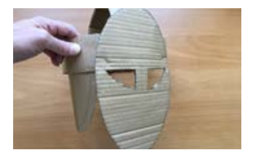
Cut out any details or shapes, like eye holes.