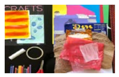
Gather all of your materials and equipment together.