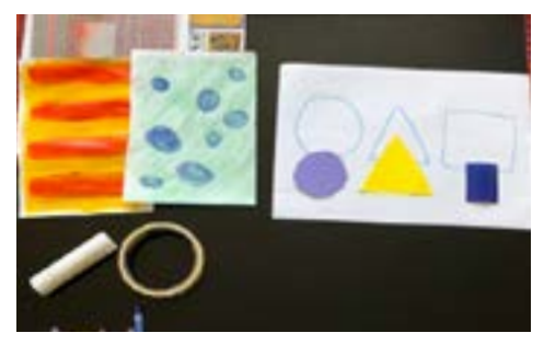
Start by cutting out shapes from the card or paper you have.