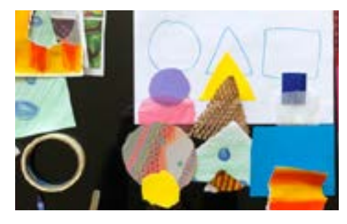
Can you tear the materials into your shapes?