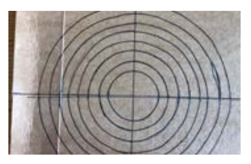
Start by drawing concentric circles from the centre of your page.

Gather all of your materials and equipment together.