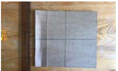
On your piece of paper or card draw a 20cmx 20cm box and draw equal dividing lines on the horizonal and vertical