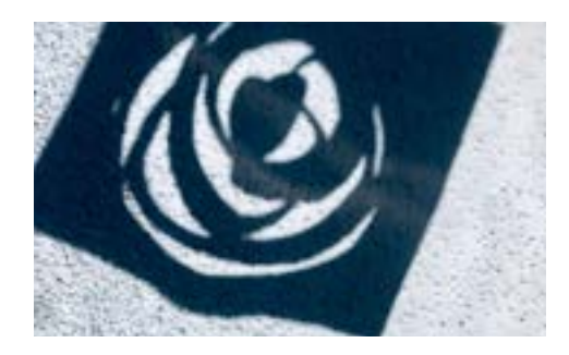
Using a camera or a smart phone photograph the shadowns that are cast by your sculpture.