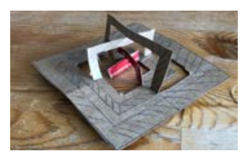
Can you make one using squares instead of circles?

Once you've cut along all your curved lines, fold the pieces along the centre lines to give a 3D shape